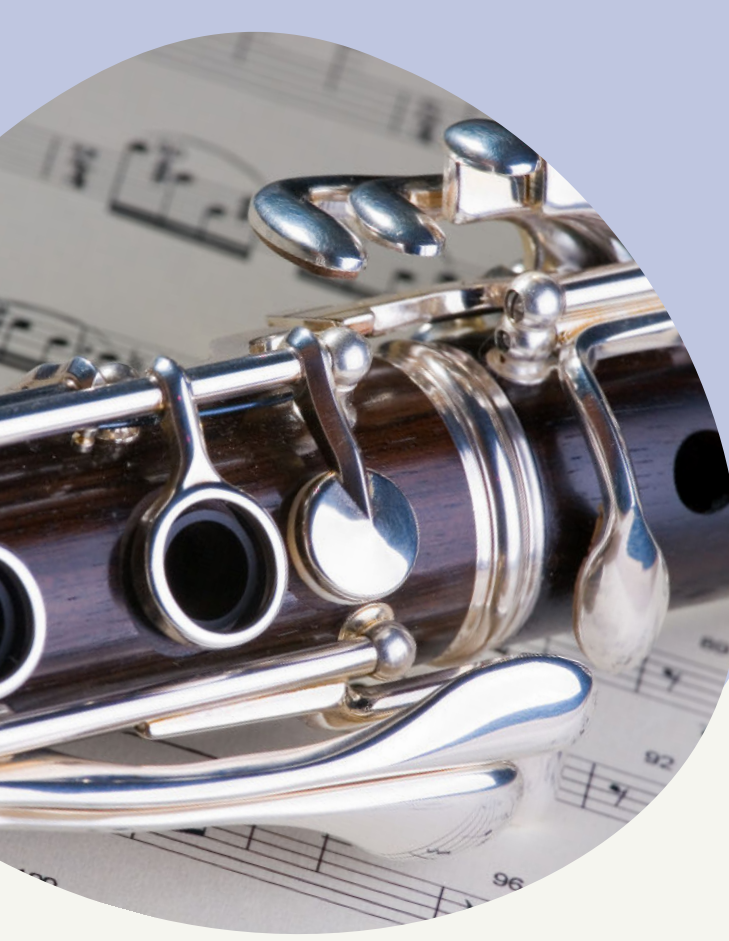
Purchasing a musical instrument